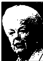
Ann Richards Former Texas governor