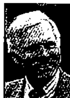
Ted Turner Time Warner Inc. vice chairman and CNN founder